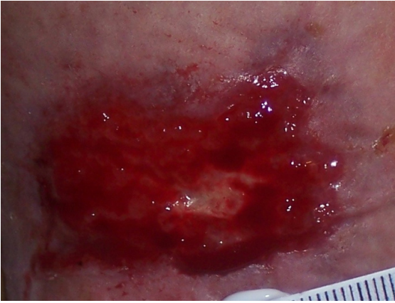
Figure 5. Healthy granulation tissue. Can be treated with pressure or topical tape (Haelan tape) steroid cream or ointment.

However, whether healthy or unhealthy, the wound generally will not heal when the tissue is 'proud' of the wound because epithelial tissue will find it difficult to migrate across the surface and contraction will be halted at the edge of the swelling.