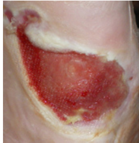
Figure 1. Granulation has smoothed out; the wound is just slightly moist and is ready for the edges to contract. The stage of healing is maturation.

When granulation is achieved, the wound bed changes, becomes less ‘wet’ and less ‘bumpy’ with a smoother wound surface (figure 1). This is the final stage of wound healing and the epithelial cells can now grow into the centre of the wound and the wound fibres will contract the surface of the wound until it reaches closure. If this happens quickly there will be less scarring (Son et al 2005). The collagen that is laid down during the granulation period is now removed and replaced by a stronger collagen and the tissue beneath the scar and the scar itself, will go on remodelling for up to two years (Dealey 2007).