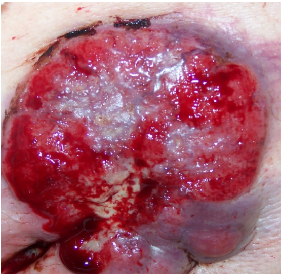
Figure 6. Unhealthy overgranulation. Extremely friable and obviously due to clinical infection, May require oral antibiotics and pressure or topical tape (Haelan tape) steroid cream or ointment.

Healthy overgranulation tissue presents as an overgrowth of moist, pinky-red tissue (figure 5) that may bleed easily (Johnson & Lea 2007) and unhealthy overgranulation tissue presents as either a dark red or a pale bluish purple uneven mass rising above the level of the surrounding skin which also bleeds very easily (figure 6). The healthy granulation tissue has the potential to reduce naturally and to eventually heal without intervention although this may take longer than if it is treated.