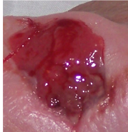
Figure 4. Overgranulation is a soft tissue that is 'proud' of the wound (Peduncle) and minus the granules that represent granulation tissue. It will not progress toward healing.

of required granulation tissue needed to replace the tissue deficit which often results in a peduncle (raised mass) above the wound (figure 4). It may be a difficult condition to manage and the presence of such tissue, as well as increasing the patient's risk of infection, will prevent or slow epithelial migration across the wound and thus delay wound healing (Nelsen 1999).